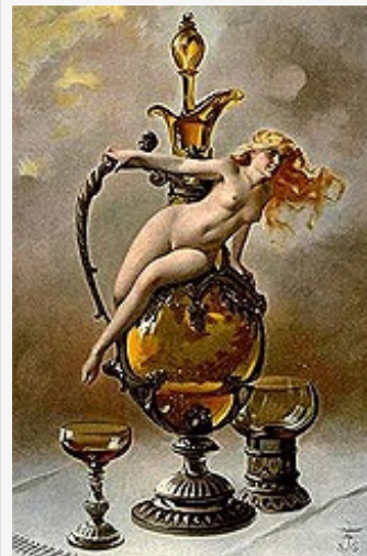
"Wine of Tokai" (1887)

Luis Ricardo Falero, born in Granada in 1851, studied art in Paris before moving to London. Falero is one of a number of painters concentrating on the nude, shown in a highly-finished manner, and in a mythological or fairy tale setting.